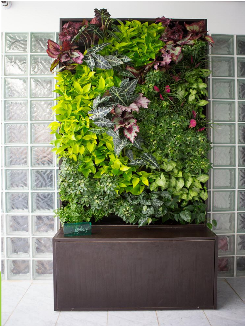
— Room divider or Single Mobile Wall